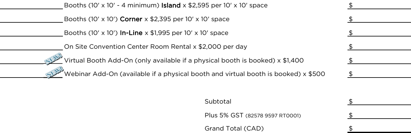
EXHIBIT SPACE (visit www.geoconvention.com to view exhibit space floor plans); Exhibition run May 13-15, 2019, Calgary Telus Convention Centre

Do you have any special placement or other considerations?