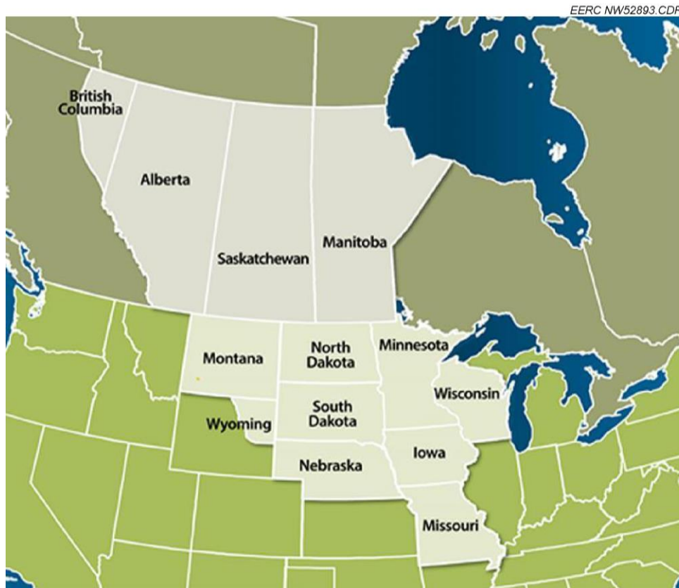
Figure 1. The PCOR Partnership region. 3

Facility—are located in close proximity to the region and supply CO 2 to the Bell Creek oil field (within the PCOR Partnership Region in southeastern Montana) for CO 2 EOR.