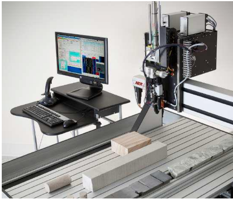
Figure 1. AutoScan – robotically-controlled gantry system for physical property measurements of several different types of core.