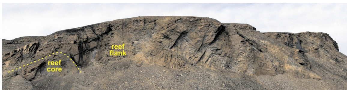
Figure 2. Early Permian Legolas reef (Ellesmere). Inclined flanks are dolomitized and porous