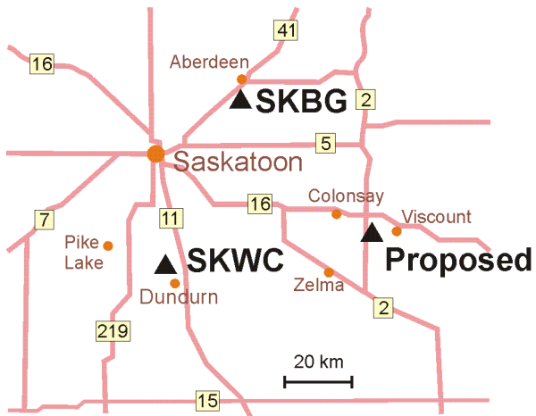
Figure 2: Current and proposed locations of the UofS regional monitoring stations.